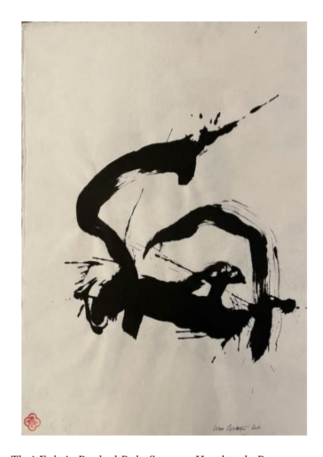
Max Gimblett 2015 (left), Full Fathom Five, Sumi Ink on Thai Fabric Backed Pulp Squares Handmade Paper 30"x22" and Pandemonium (right, 2016) Sumi Ink on Thai Garden 100% Kozo Plain Smooth Handmade Paper 30"x22."