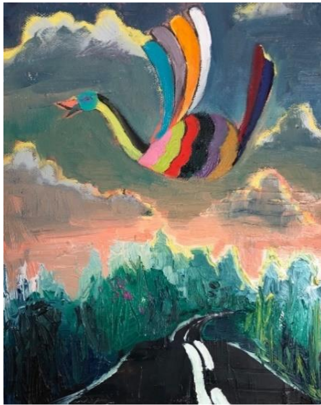
Katie Ruiz. Otomi Skies. Oil on Canvas 10" x 8"

The paintings in this show are a reaction to transcendental painting while following the Moon cycle and my flow states. Although abstract, all the work has a very feminine and figurative feel, with fleshy colors and rounded shapes. The other world-like paintings are based on the textile patterns of animals and birds from the Otomi.