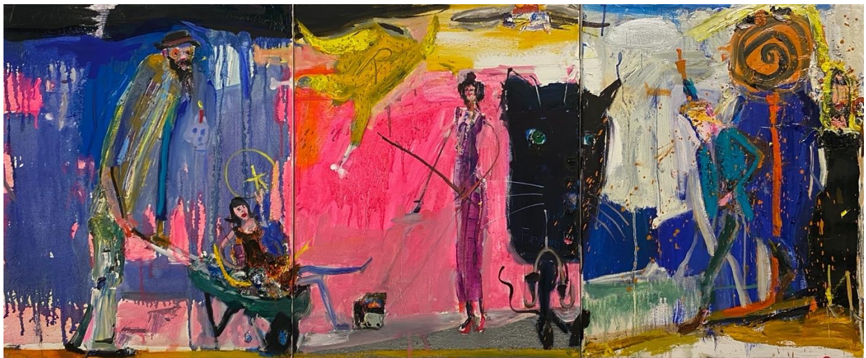
Matt Blackwell 2020, Triptych. 20"x 48" Oil on Canvas