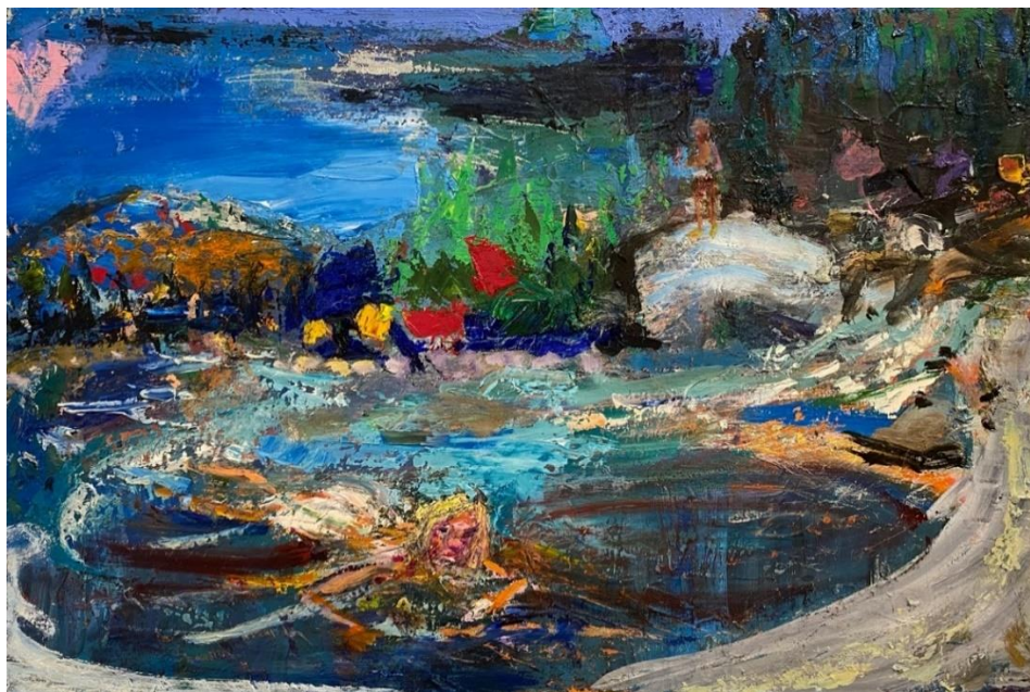
Matt Blackwell 2012, Venus's Pool. 16"x22" Oil on Canvas